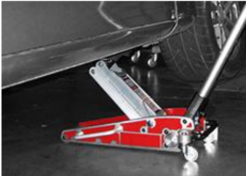
1.5 Ton Aluminum Service Jack